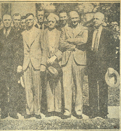
After their meeting Tuesday morning.