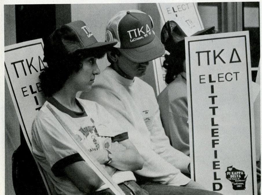
Business meetings can be tiring.