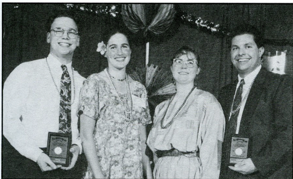
Superiors in open parliamentary debate.