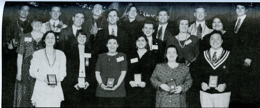
Superiors in impromptu.