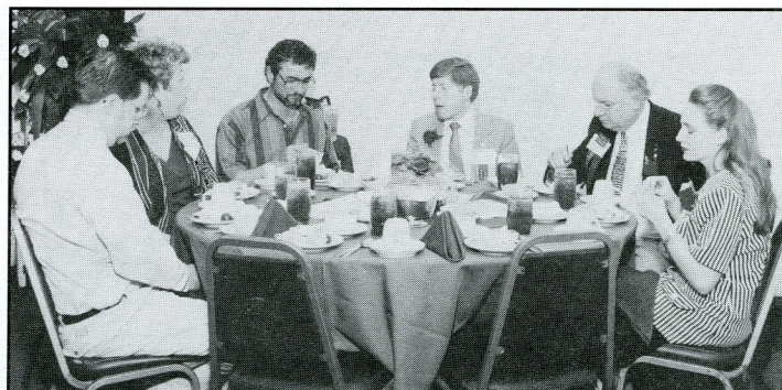
Part of National Council at work.