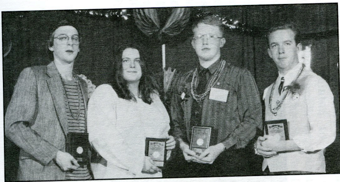
Superiors in open CEDA.