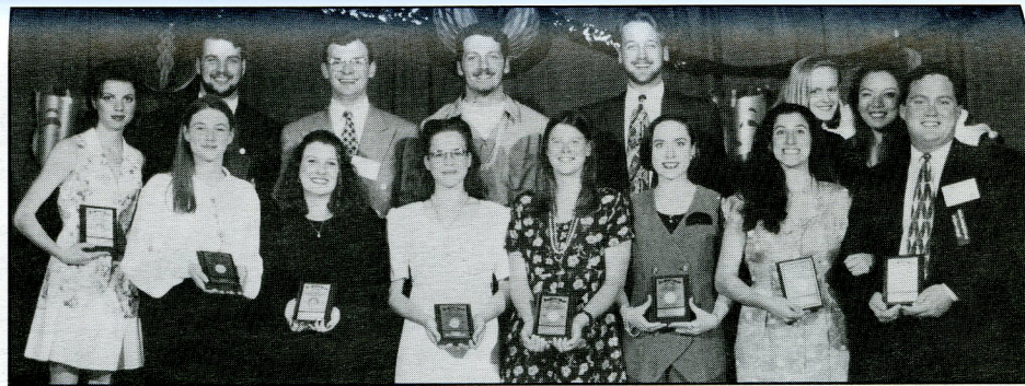
Superiors in duo interpretation.