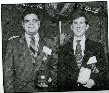
Superiors in open Lincoln-Douglas.