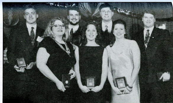
Superiors in after dinner speech.