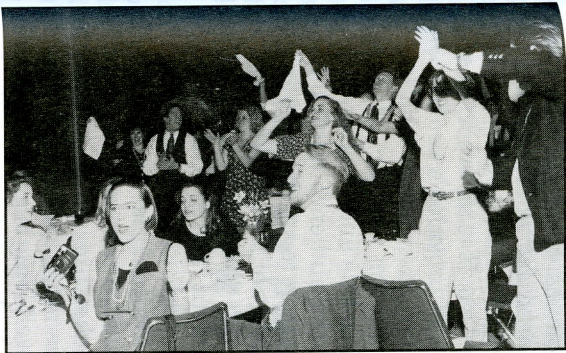
PKD banquet celebration...Rolling on the Red.