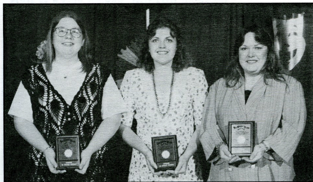
Superiors junior – Lincoln-Douglas.