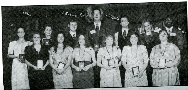
Superiors in poetry.