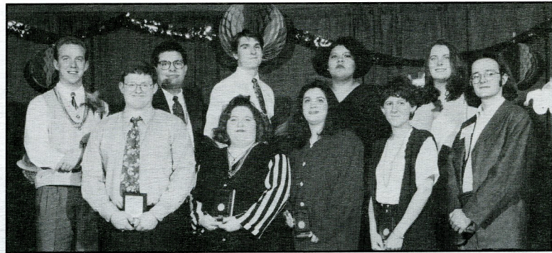
Superiors in extemporaneous.