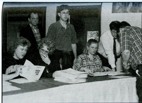
Registration PKD Nationals at Shreveport.