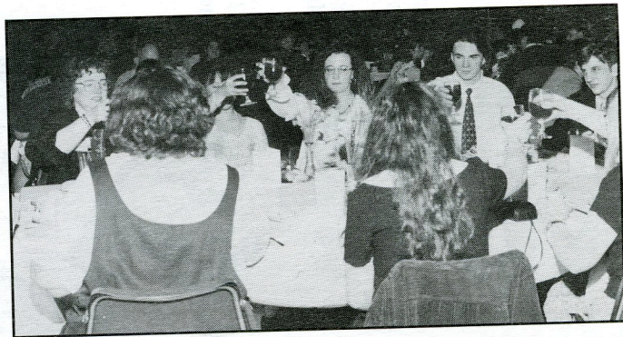
UPS gives a toast at PKD banquet.