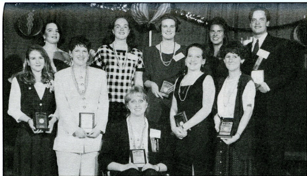
Superiors in persuasion.