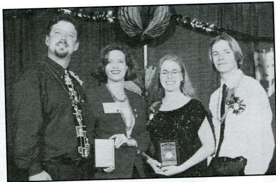
Superiors in novice parlimentary debate.