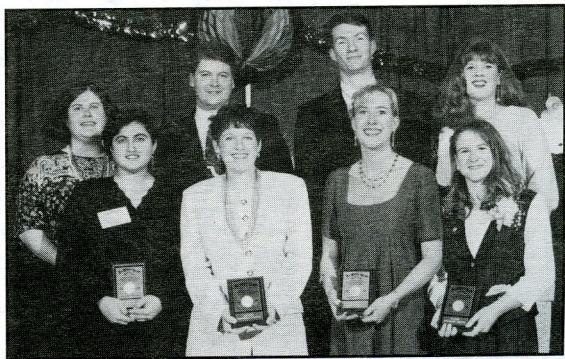
Superiors in informative