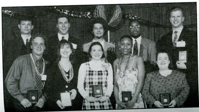
Superiors in dramatic interpretation.