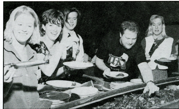
Cajun delicacies no longer wriggling.