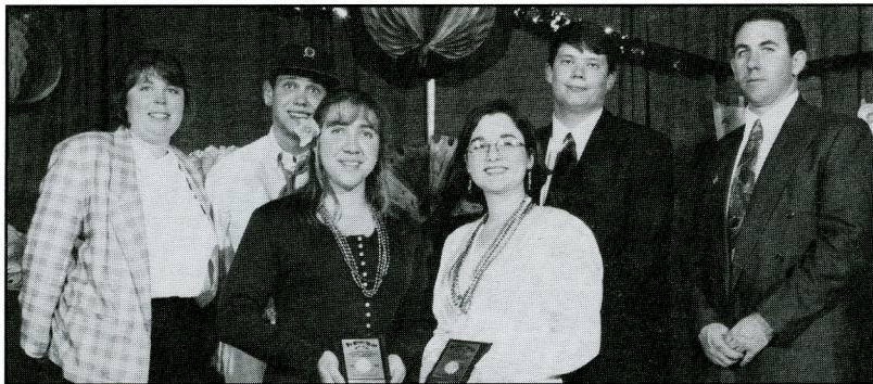
Superiors novice CEDA