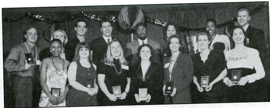
Superiors in prose.