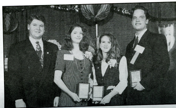
Superiors in experimental debate.