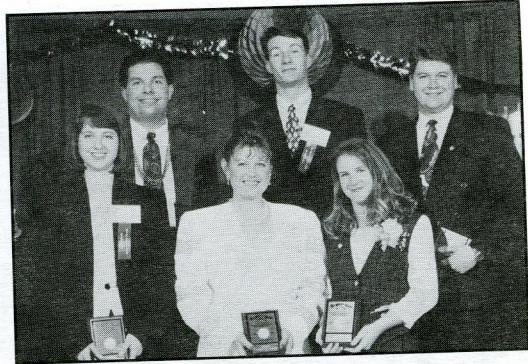
Superiors in communication analysis.