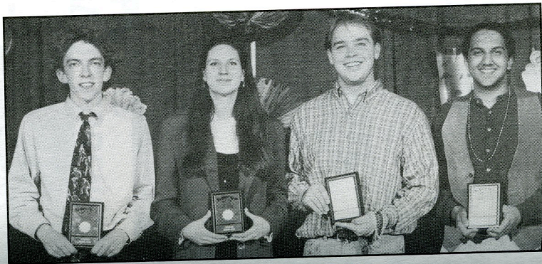
Superiors in junior CEDA.