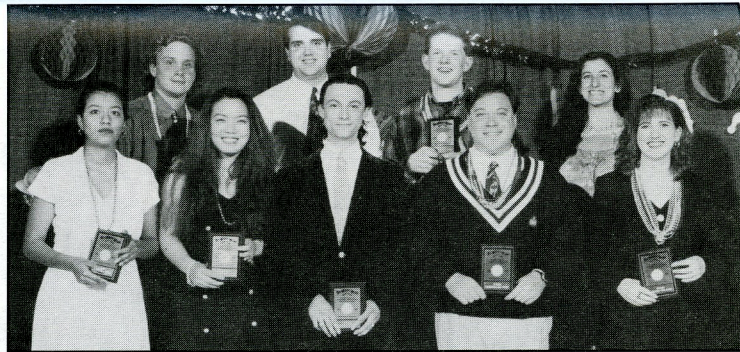
Superiors in program oral interpretation.