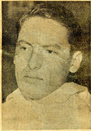
"It doesn't hurt, but I wonder how I look."