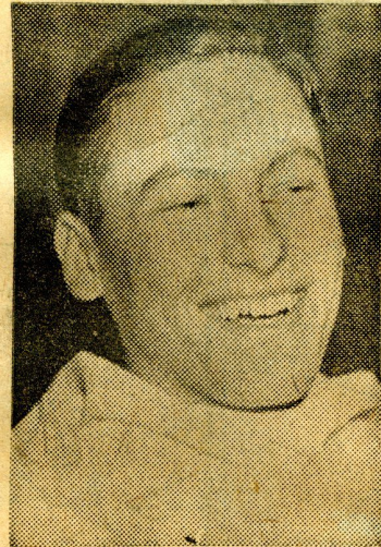
"Come on Mr. Make-Up Man. I can take it".