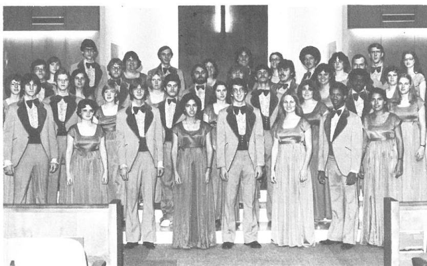
1981 Concert Choir

The University has a flexible calendar that allows a combination of short-term and semester-length courses. Cross-cultural and cooperative education programs afford off-campus travel, study or work experiences.