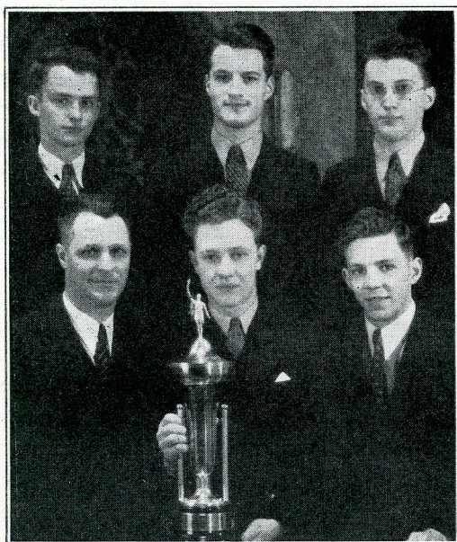
AUGUSTANA (ILLINOIS) TEAM