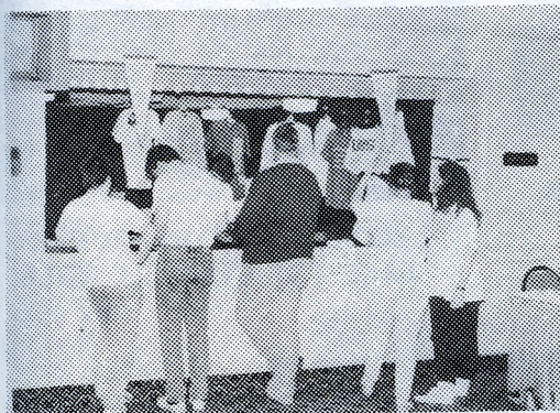
STUDENT STORE MEETS & GREETSS