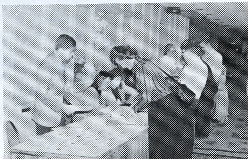
REGISTRATION IS A BREEZE