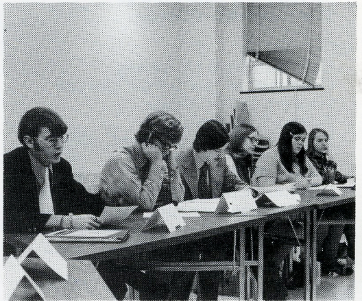
The Committee on Governance deliberates at the joint convention of the Provinces of Illinois and Upper Mississippi. It is to be hoped that the condition of the window shade does not reflect the state of the participants' minds.