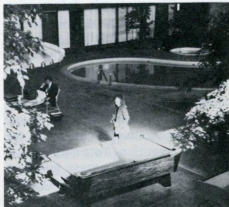
Relaxation time for contestants at the Plains and Missouri Province tourney.

"The Province of the Pacific held its first tournament in nearly a decade in conjunction with the Mustang Invitational hosted by California Polytechnic at San Luis Obispo. Five PKD schools were in attendance with the following three schools receiving the largest number of sweepstakes points: First—CSU, Northridge; Second—CSU, Hayward; Third—Pepperdine University."