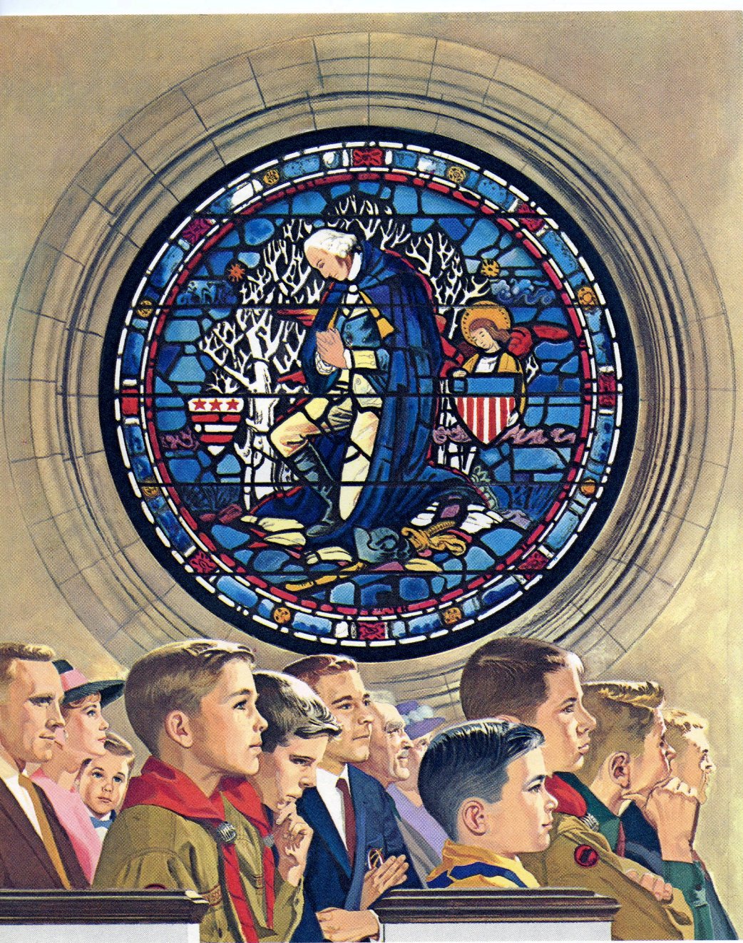
First Baptist Church SIOUX FALLS, SOUTH DAKOTA