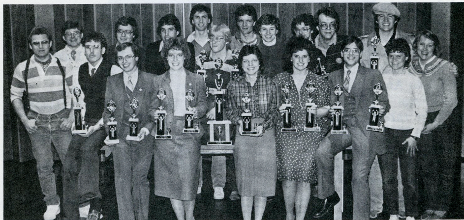
1st Place Sweepstakes Winners—North Dakota State University, Fargo, ND (Sioux)