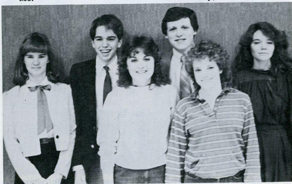
Top 3 CEDA Teams in the Tournament Bethel College (left), William Jewell (front), and Southwest Baptist (right.)