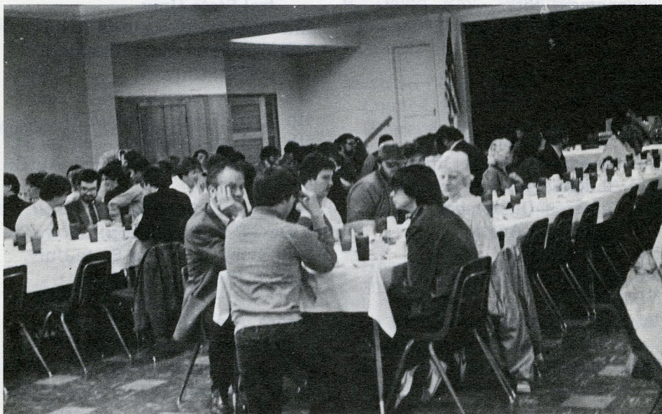
Lower Mississippi Province Tournament Banquet