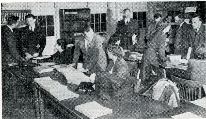
REGISTRATION AT BRADLEY SPEECH TOURNAMENT