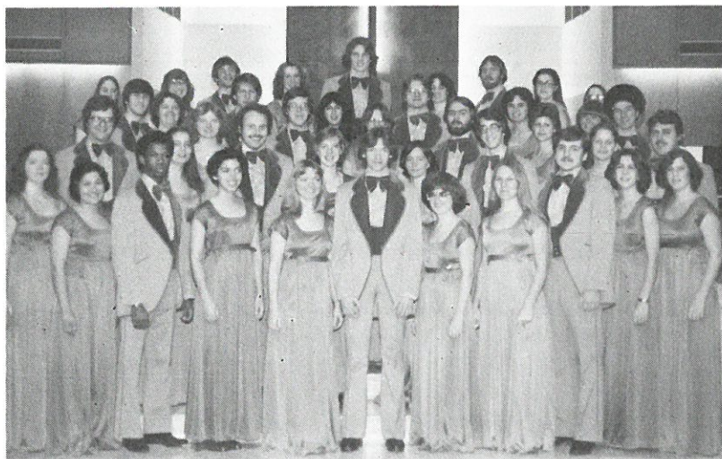
1980 Concert Choir