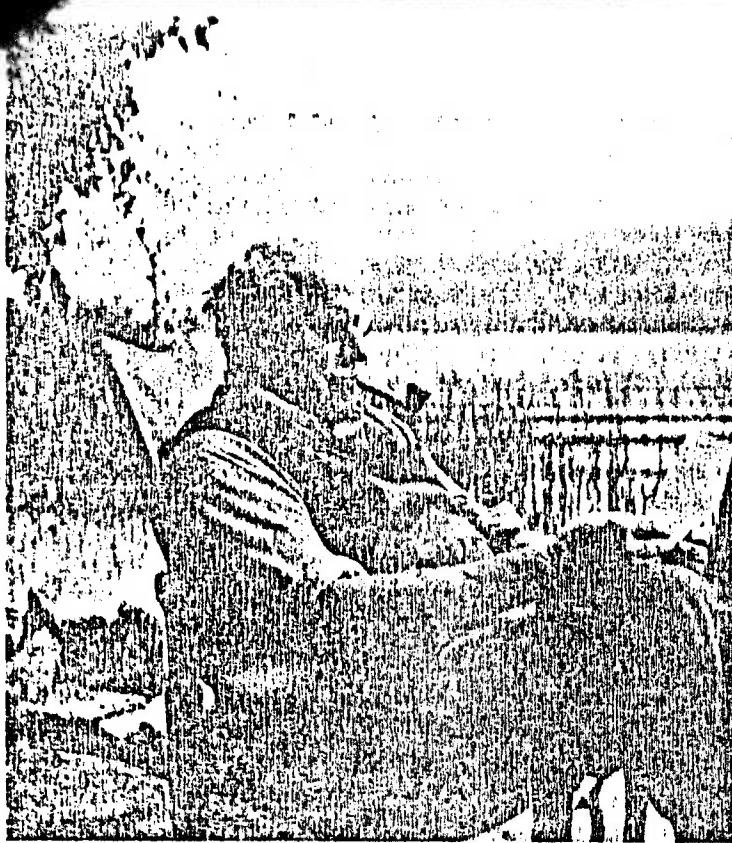
Carl Gustav Jung 1875-1961

Kusnacht-Zurich Seestrasse 228 January 30, 1961