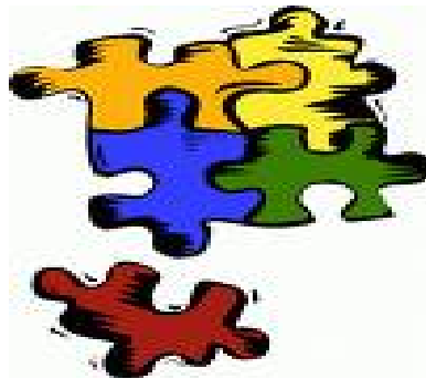
PIECING THE OU ARCHIVES PUZZLE TOGETHER

Fitting into this puzzle, librarians have decided to do what they can to reach out to their patrons at Ottawa University and start a library Blog in Blogspot. Actually, the OU Library Blog was created back in 2007, after librarians were exposed to blogs and blogging at several library conferences and were watching closely what their colleagues in the library field were doing. Back then, it was not at all