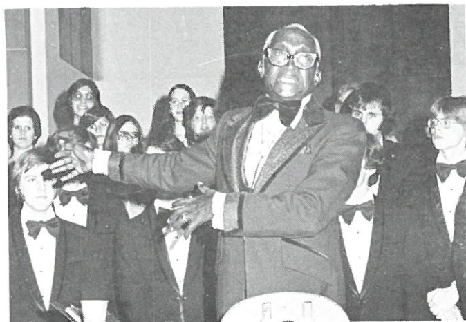
Jester Hairston Conducts OU Choir.

THE UNIVERSITY Ottawa's unique educational program is attracting national recognition and support because it contains so much of what today's students are seeking: