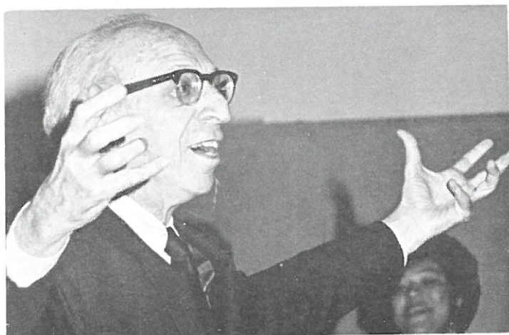
Aaron Copland Rehearsing OU Choir.

Fries is annually involved in clinics and workshops, and participates as adjudicator for state music festivals, Federation of Music Clubs, and Metropolitan Opera Auditions.