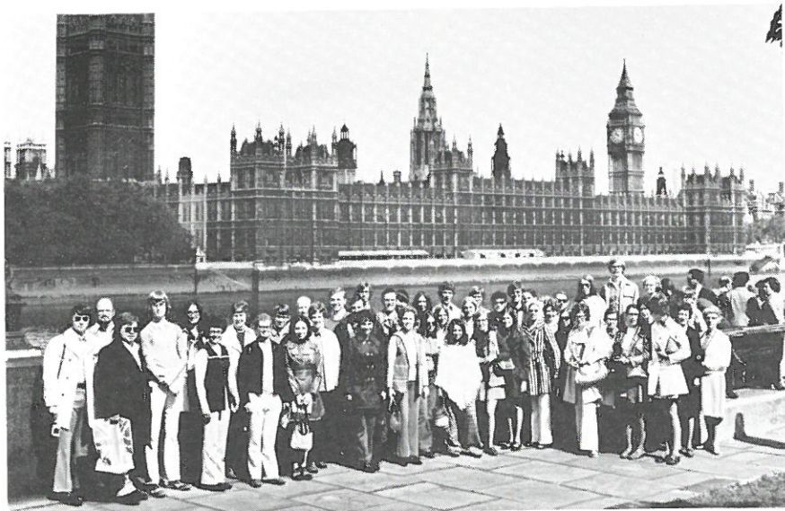
European Tour 1972.