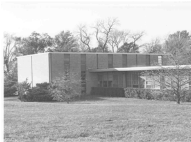
An archival picture of the Myers Library

Students staffing the library on Saturdays in the past found that there were not many library visitors when they were on duty on Saturdays. Some students did use the library to work on their homework assignments; but the majority of students were coming into the library for just a few minutes, during the time that it